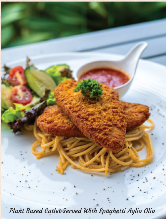
Plant Based Cutlet Served With Spaghetti Aglio Olio

Deep fried cutlet, and sautéed pasta with chili flakes, mesclun mixed with honey mustard dressing