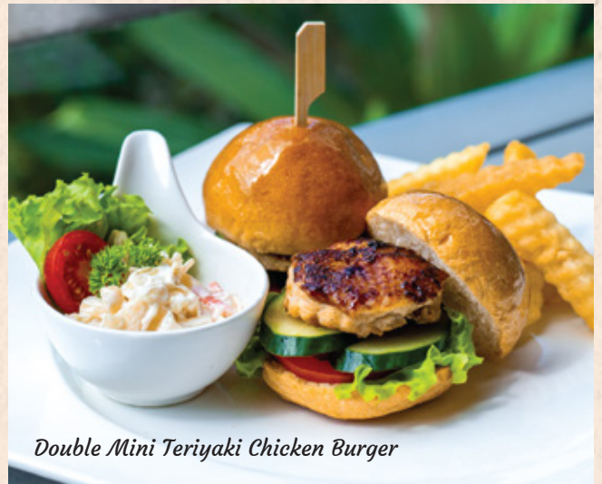
Double Mini Teriyaki Chicken Burger