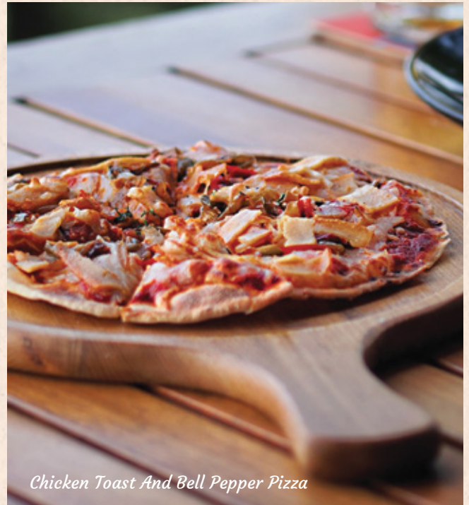
Chicken Toast And Bell Pepper Pizza