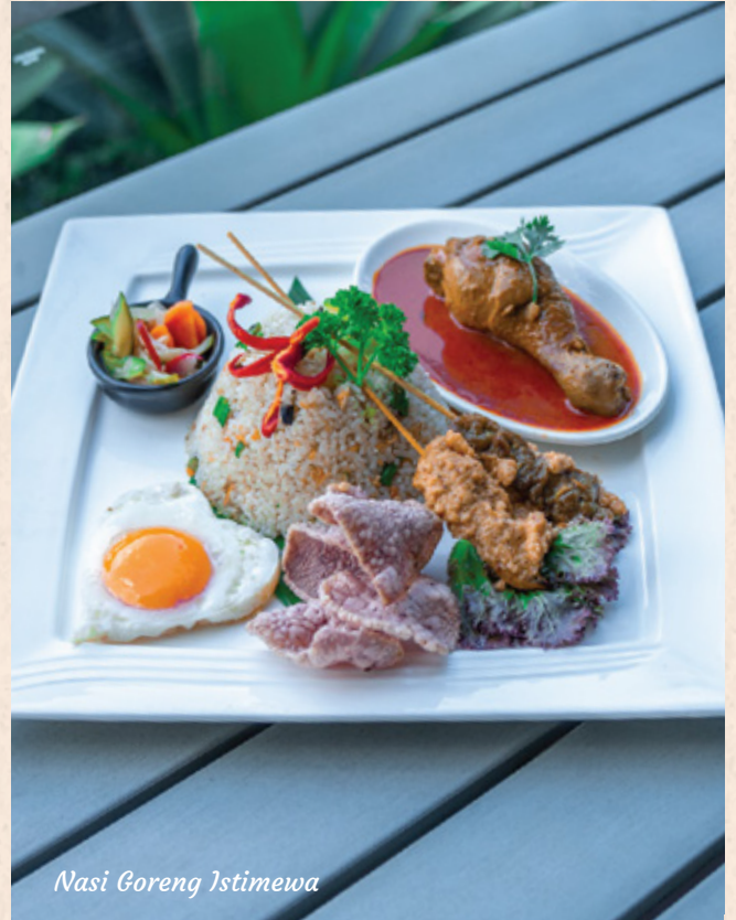
Nasi Goreng Istimewa