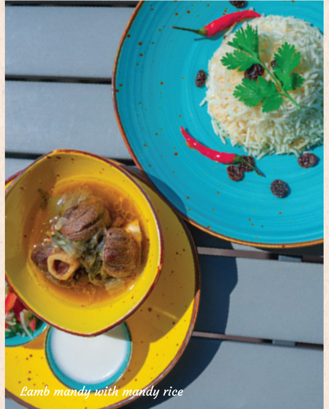
Lamb mandy with mandy rice