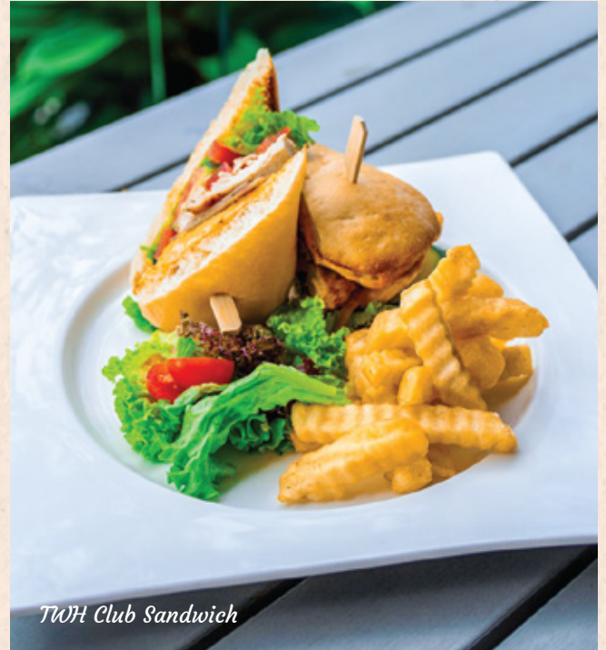
TWH Club Sandwich