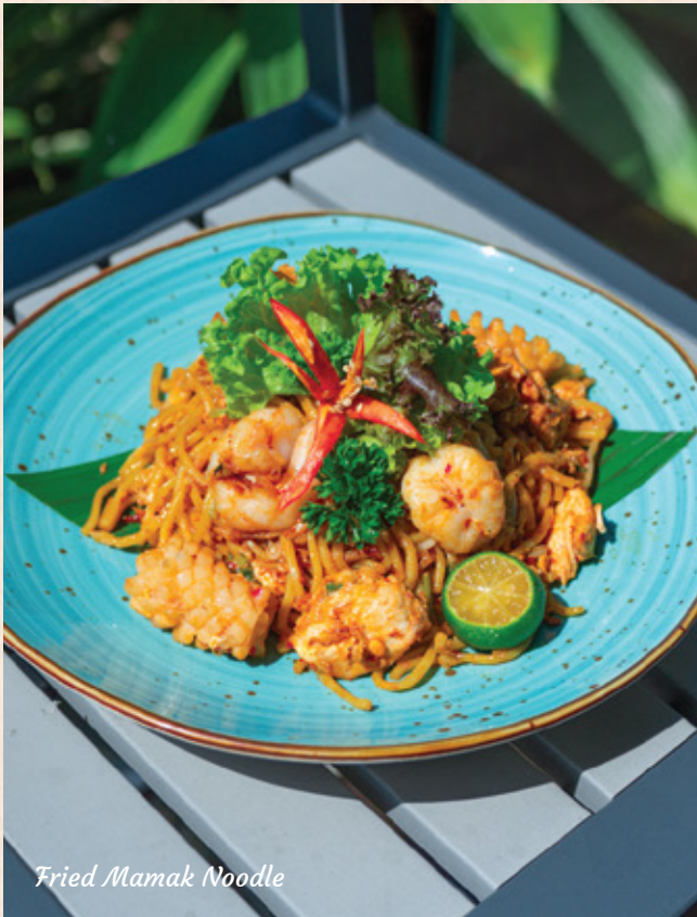
Fried Mamak Noodle

Deep fried herbs marinated chicken cuts with galangal, lemon grass, and coriander seed served with fragrant rice, sambal, and 'ulam'.