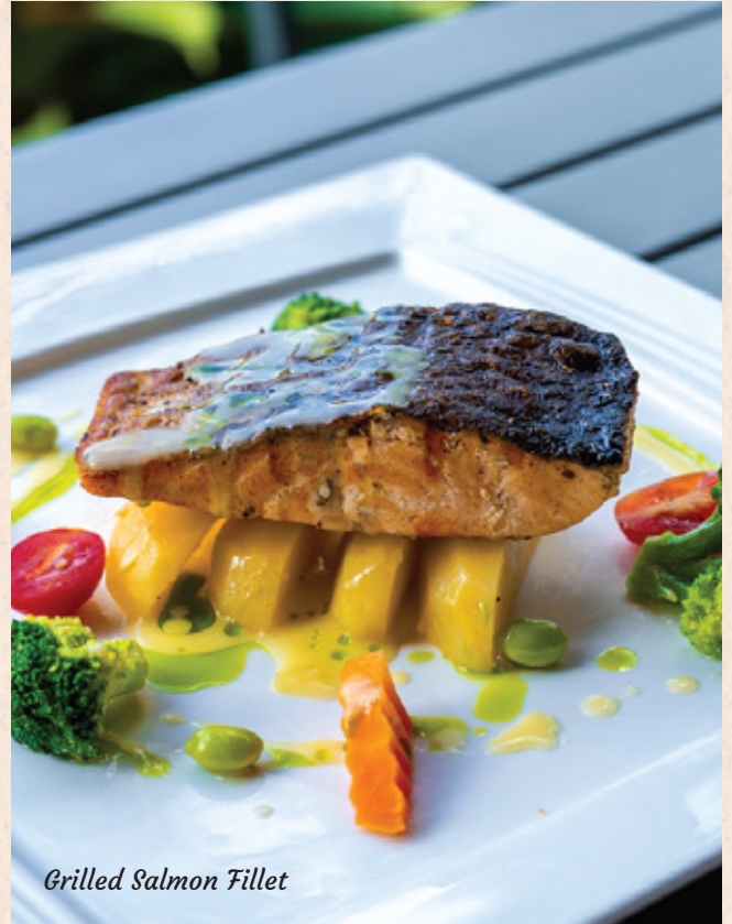
Grilled Salmon Fillet