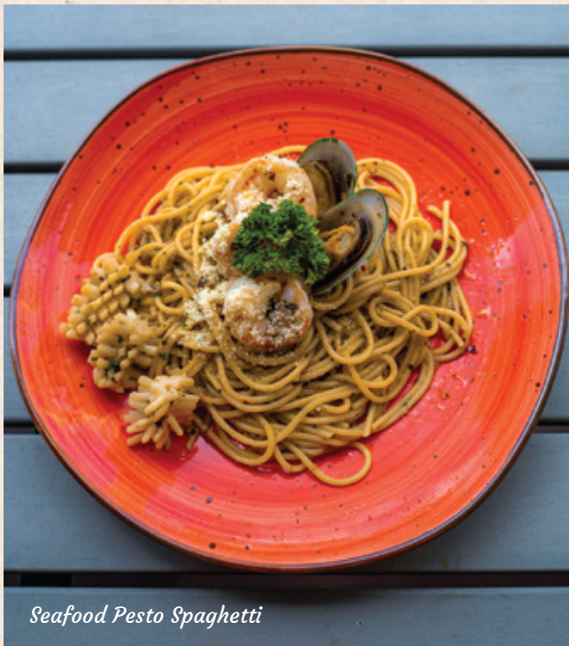
Seafood Pesto Spaghetti

With sautéed homemade pesto, mussels, squids and prawns